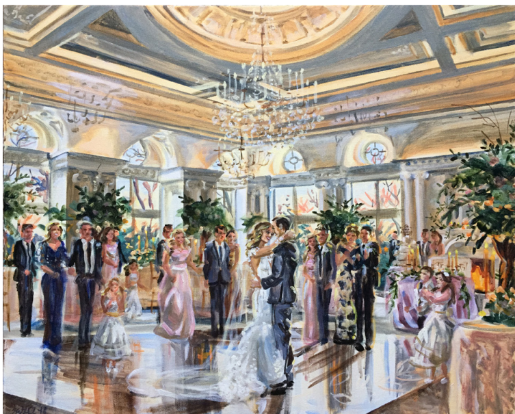
24"H x 30"W

The 24"x 30" and 22"x28" are more square and emphasize the ceiling and center of the dance floor more – good for capturing venues with higher ceilings!