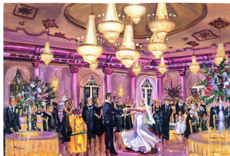
20"H x 30"W

The 24"x36" and 20"x30" are more panoramic and allow for a wider angle of the room so you can see more tables and windows.