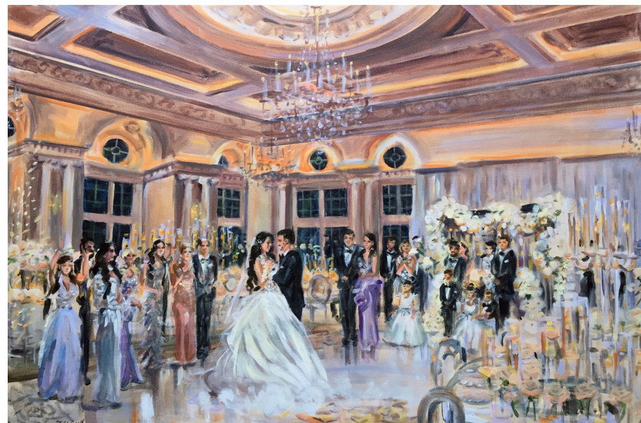
24"H x 36"W

The 24"x36" and 20"x30" are more panoramic and allow for a wider angle of the room so you can see more tables and windows.